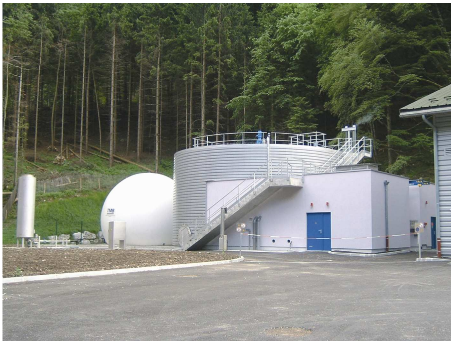
View of the biogas unit

The digested sludge are composted before to spread on fields.